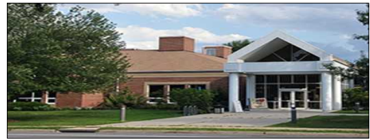
Sherwood Regional Library