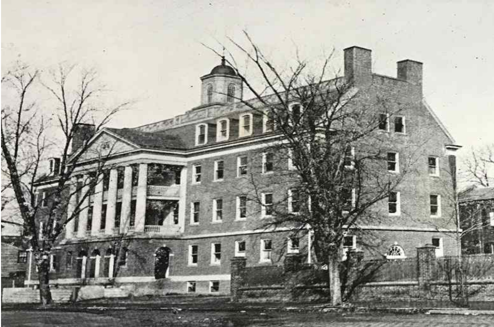
Alexandria Hospital, Duke Street, 1917

Alexandria Hospital: Women Mobilize the Community October 28, 2023, 2:30 to 3:30 p.m. The Lyceum, 201 S. Washington Street