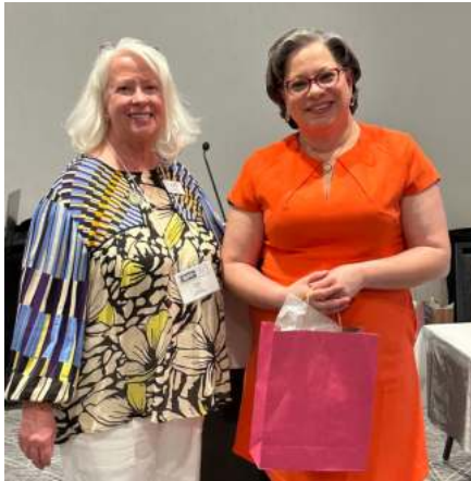
US Representative Jennifer McClellan