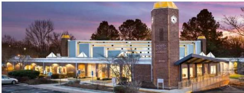
Pohick Regional Library

AAUW-VA Northern District Meeting November 1, 2025, 12:00 p.m.